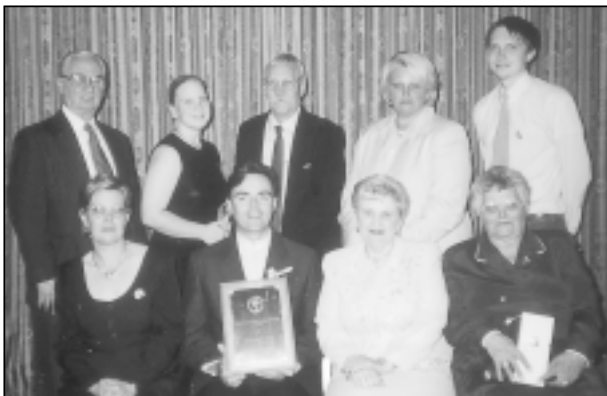
Holy Ascension Chapter

The Spiritual Advisor writes "Our UOL chapter members have been a cornerstone in the continuing life of our parish. Our UOL chapter leadership and members are always full of ideas, ambition and dedication that work in harmony with the initiatives of the National UOL programs and life of our parish."