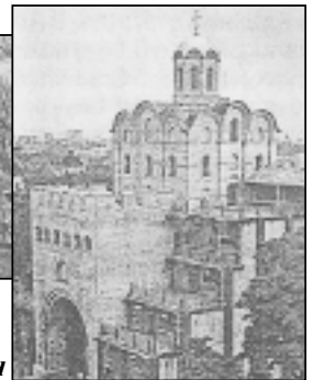
Golden Gate: restored

The splendor of the Gates was accented by the Church of Atonement built above the tower. The Gates may have been named for the roof of the church which was possibly covered with gold or for the Golden Gates of Constantinople.