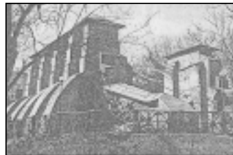
Golden Gate: remnants