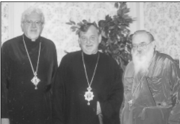
Archbishop ANTONY, Metropolitan CONSTANTINE, and Archbishop VSEVOLOD