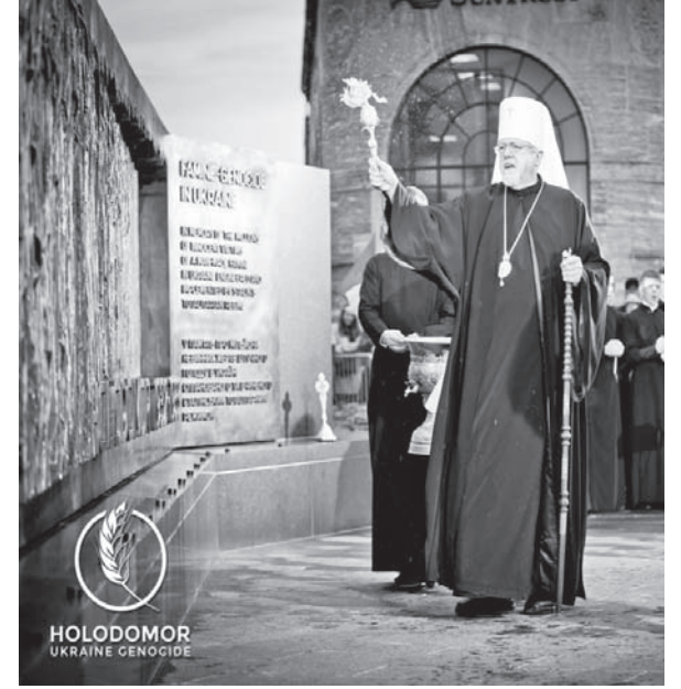
(continued on page 4)

The highlight of the program was the blessing of the monument by the hierarchs and clergy in attendance. The blessing was broadcast on a Jumbotron to the participants at Columbus